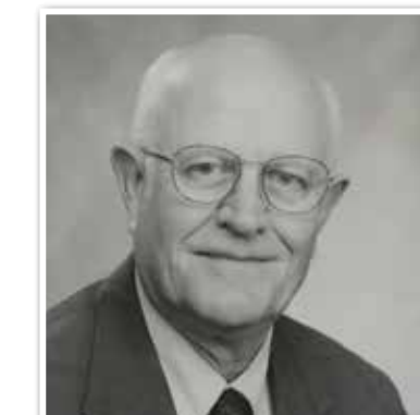
Joe Graff Memorial Scholarship

"I am excited for the next steps in my life, and I would not have this opportunity without your help. I will continue to show dedication and hard work; most importantly, I will try to pass on the generosity you have shown me."