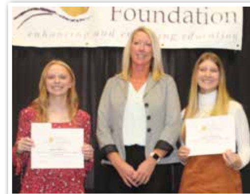
Spencer Golf and Country Club Ladies League Scholarships